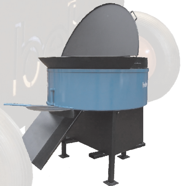
B 800 with dust cover, border apron, outlet chute and forklift carriage