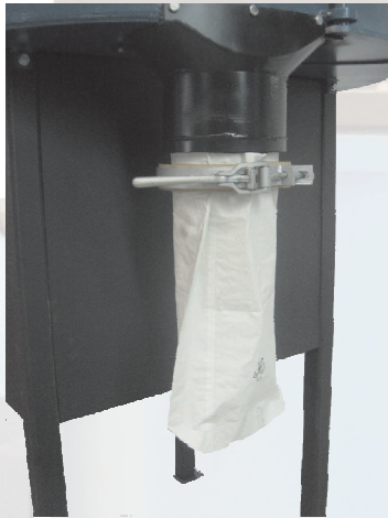
B 800 - clamp to fix the sack