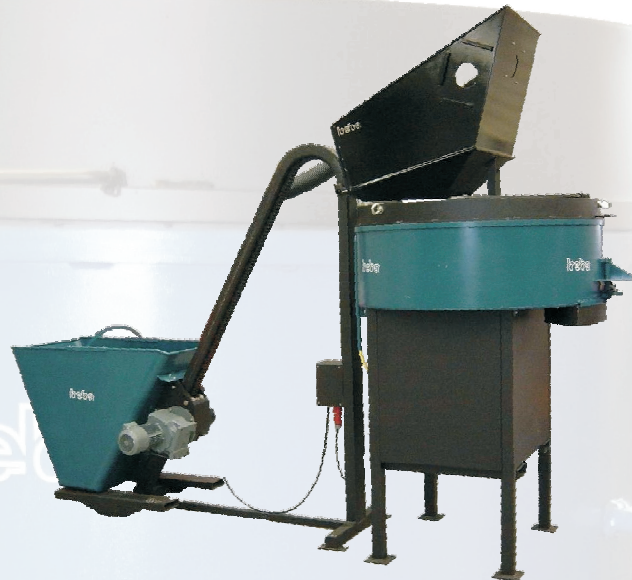
B 800 with filling system