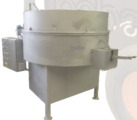
B 800 complete in stainless steel